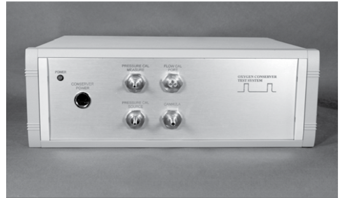
Test System Front